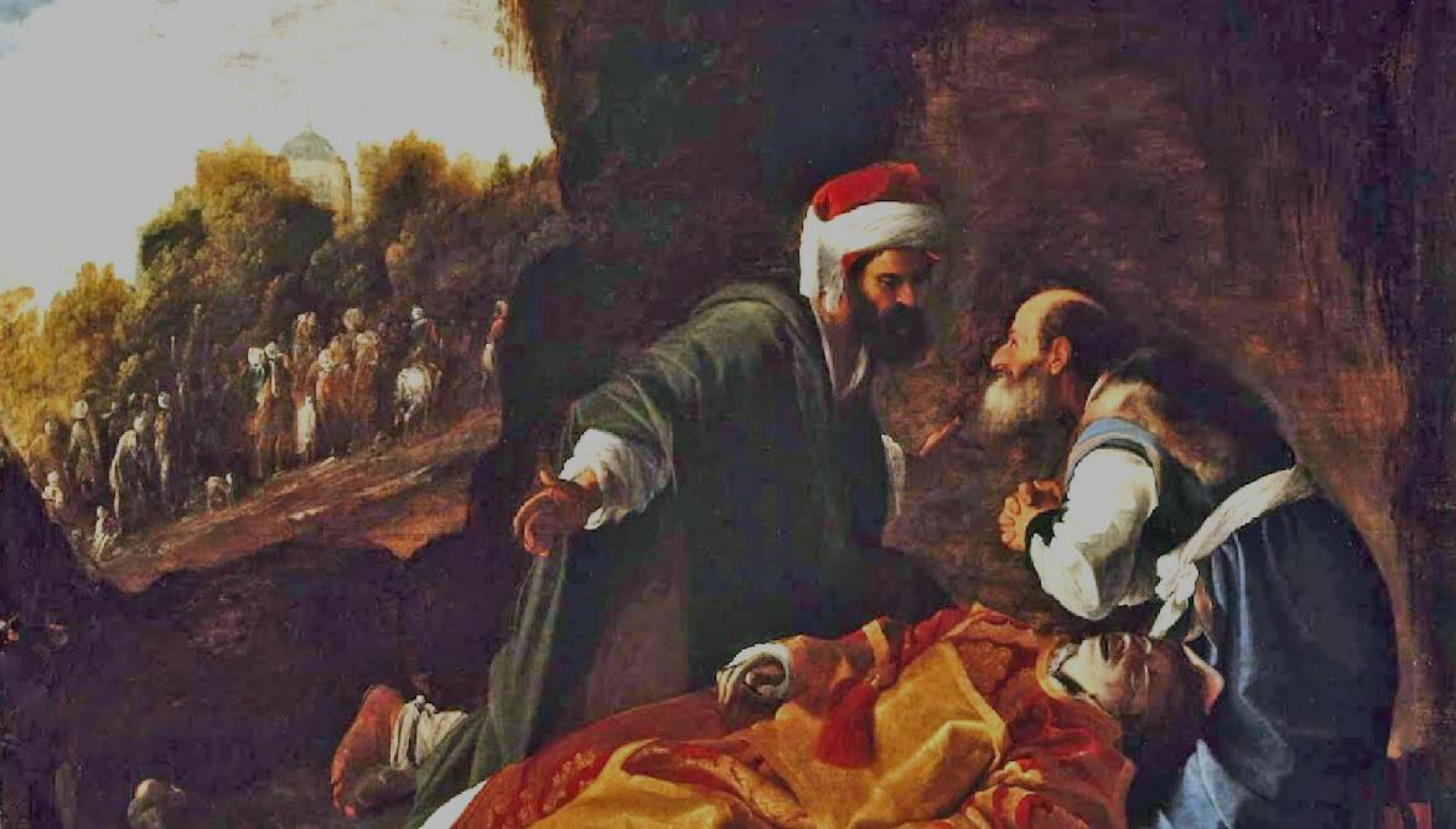
Gamaliel & Nicodemus