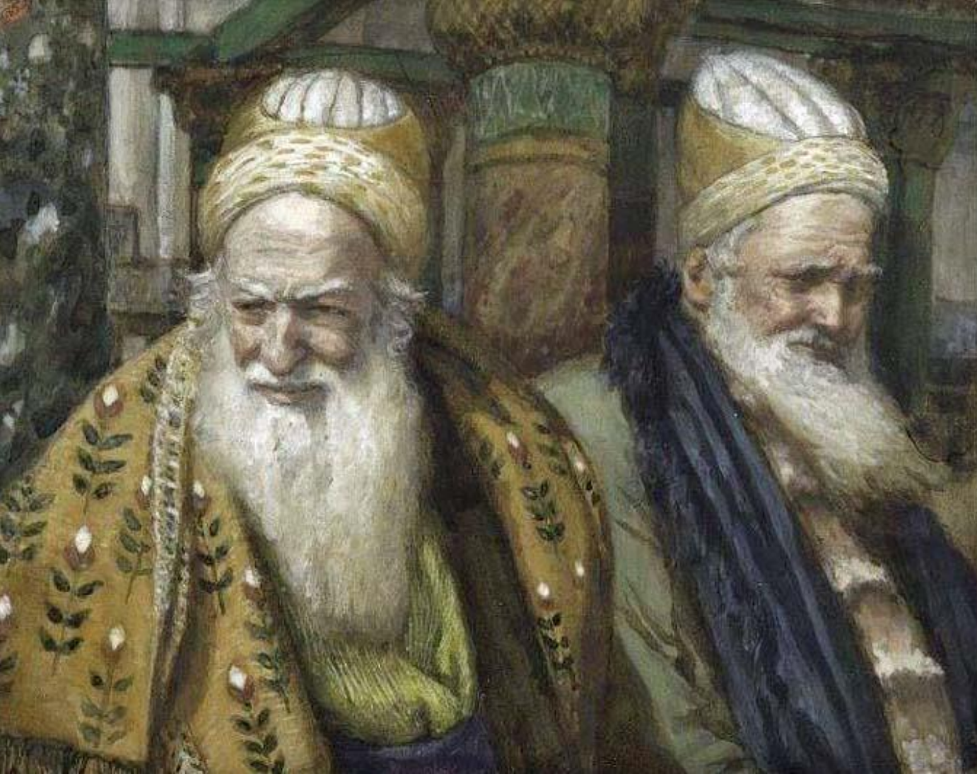
Annas ~22 BC to ~40 AD