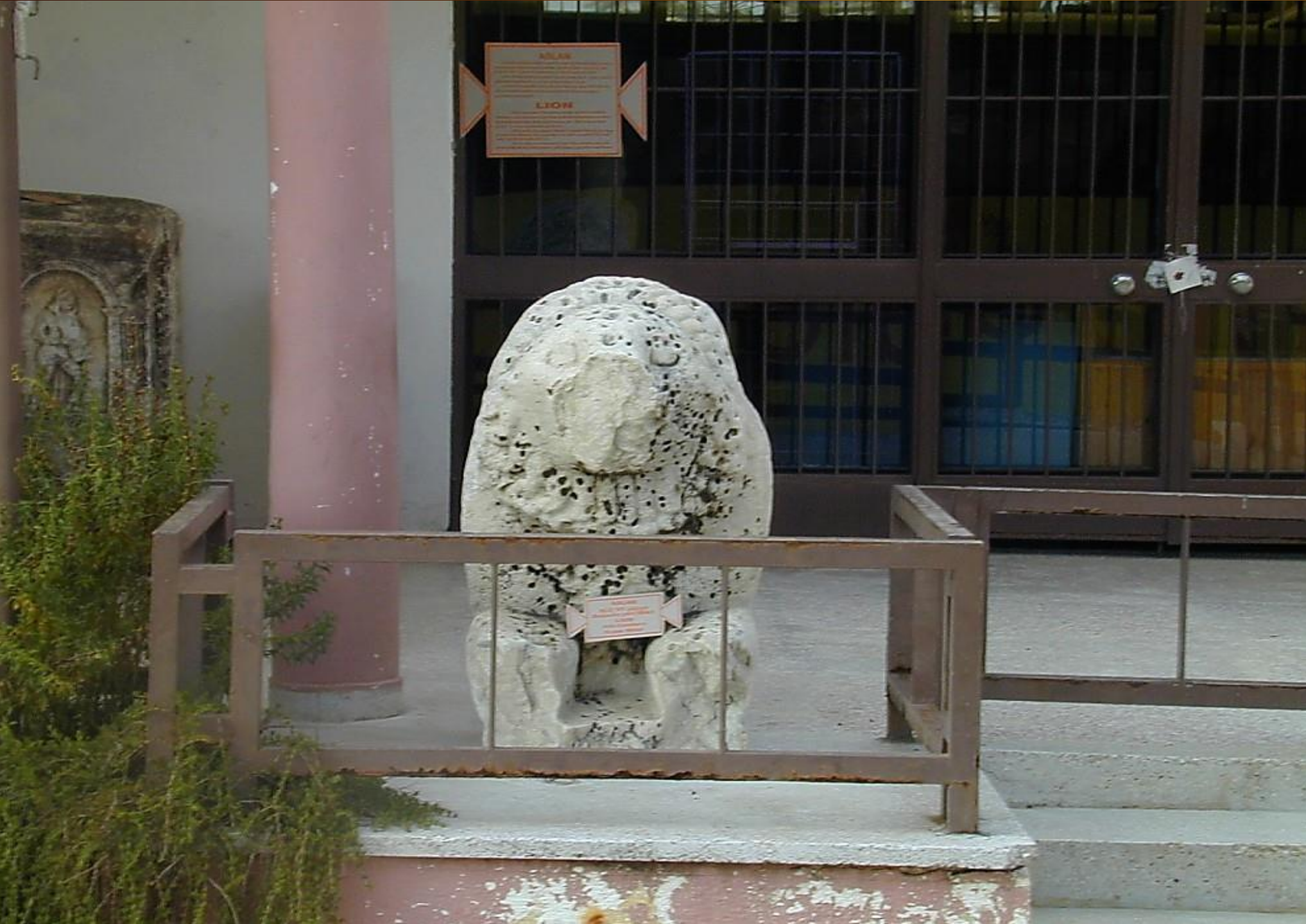
Miletus Lion Statue