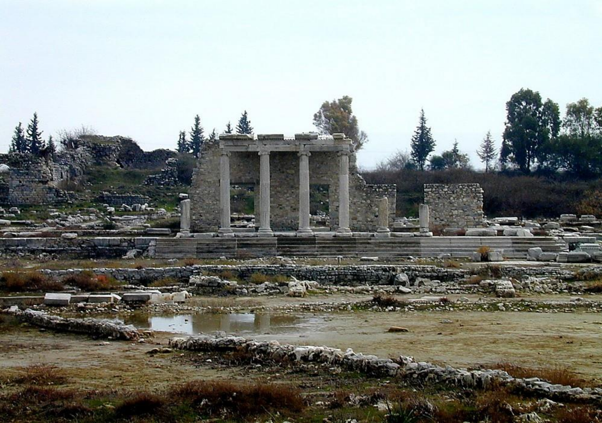
Miletus Agora & Public Building