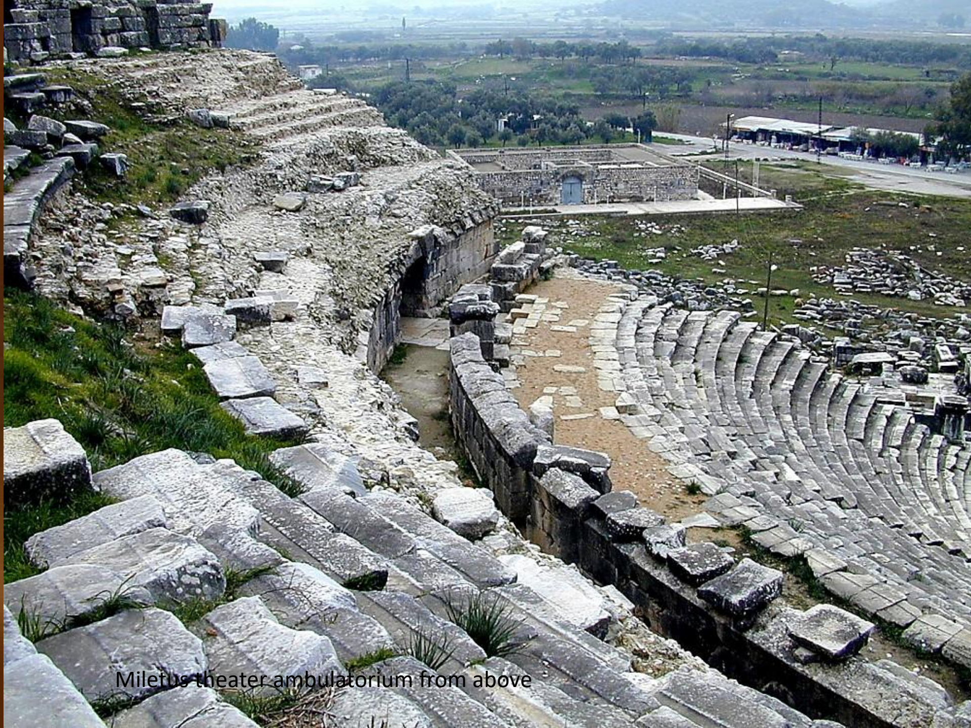
Miletus theater ambulatorium from above